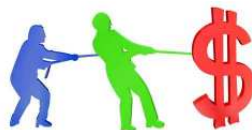
Millions of Investors