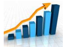
Effective IR Marketing Campaign